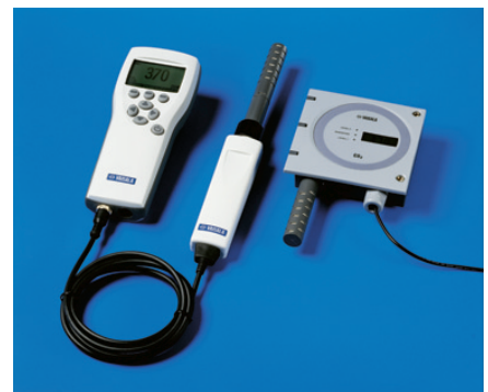
Vaisala's GM70 (left) and GM220 Series (right) both feature interchangeable probes. As a result, GM70 can be used to adjust the GM220 series probes in the field.

GM70 can be used for checking the calibration of Vaisala's GM20 and GM220 Series fixed CO 2 transmitters. The interchangeable probes of the GM220 Series can also be adjusted by using the GM70 Meter.