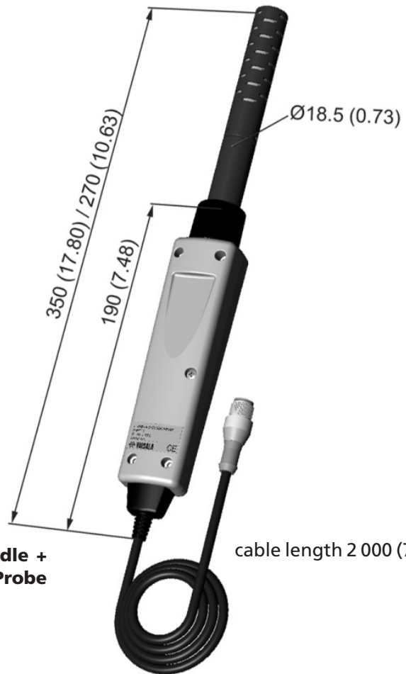
GMH70 Handle + GMP221/2 Probe