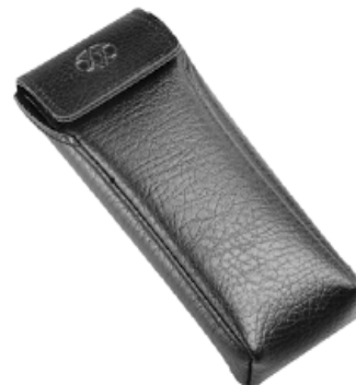
HM34 Carrying Case

The handy HM34 provides accurate spot checks of humidity and temperature.