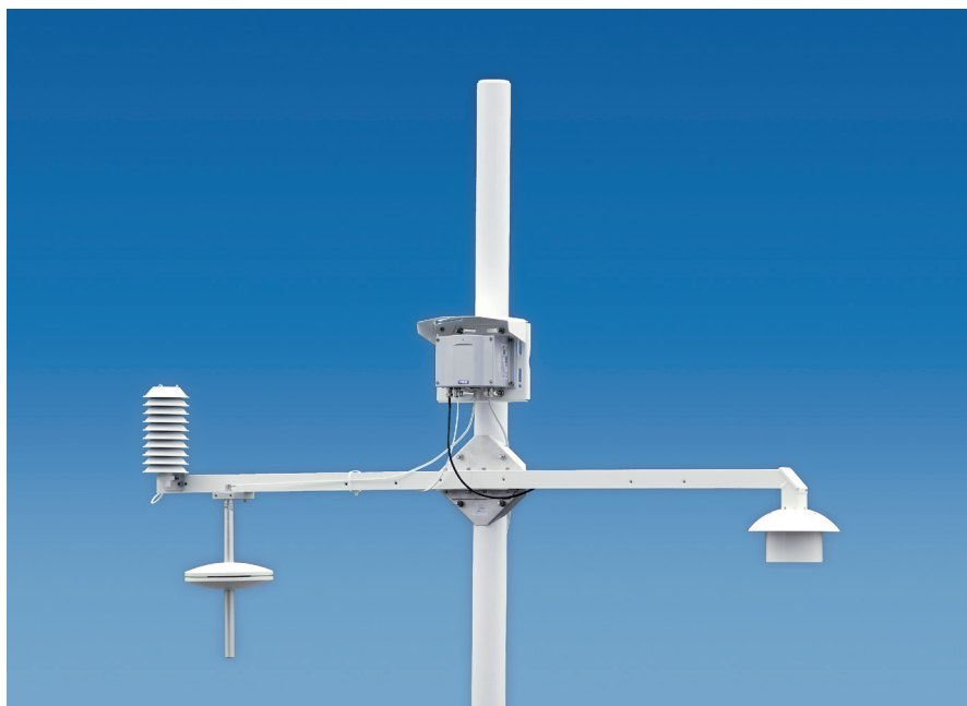
The HMT337 and PTU307 feature warmed probe technology. Installed with the HMT330MIK kit either one forms the right choice for reliable humidity measurement in humid weather conditions.

The Vaisala Meteorological Installation Kit HMT330MIK enables the Vaisala HUMICAP® Humidity and Temperature Transmitter HMT337 to be installed outdoors to obtain reliable measurements for meteorological purposes.