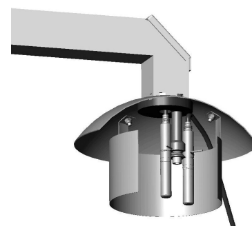
For calibration, a portable HMP77 reference probe is easy to attach beside the HMT337 or PTU307 probe.

Obtaining a true humidity reading is particularly important e.g. in traffic safety: at airports and at sea as well as on the roads. It is essential, for example, in fog and frost prediction.