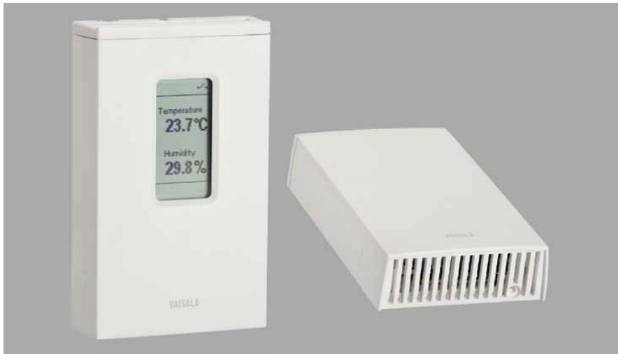
The HMW90 Series Humidity and Temperature Transmitters are designed for demanding HVAC applications.

Wall-mounted Vaisala HMW90 Series HUMICAP® Humidity and Temperature Transmitters measure relative humidity and temperature in indoor HVAC applications, where high accuracy, stability, and reliable operation are required.