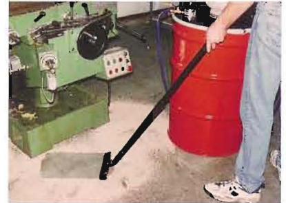
Room air remains dust free as the Chip Vac removes dusty absorbent.

Electrically operated "all purpose" vacuums aren't designed for use in industrial environments. As a result, motors wear out quickly and impellers clog. The Chip Vac has no moving parts to wear out or break which ensures long life. Sound level is half that of electric vacs.