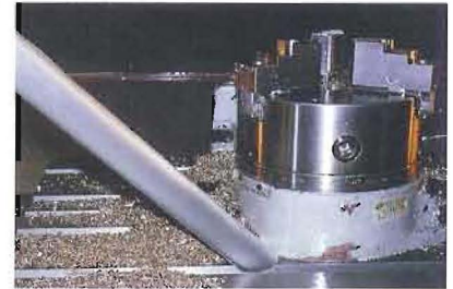
The Chip Vac removes abrasive stainless steel chips from a CNC.

The compressed air operated Chip Vac is an industrial duty vacuum designed specifically for vacuuming chips. It creates a powerful direct flow action that vacuums metal, wood or plastic chips into a 55 gallon drum. Dusty materials such as absorbents are trapped by the 0.1 micron filter bag to keep the surrounding air clean.