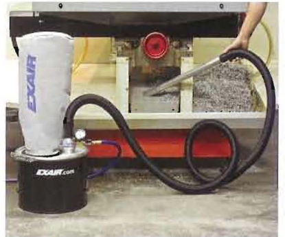
The Mini Chip Vac allows for easy clean up of small messes.