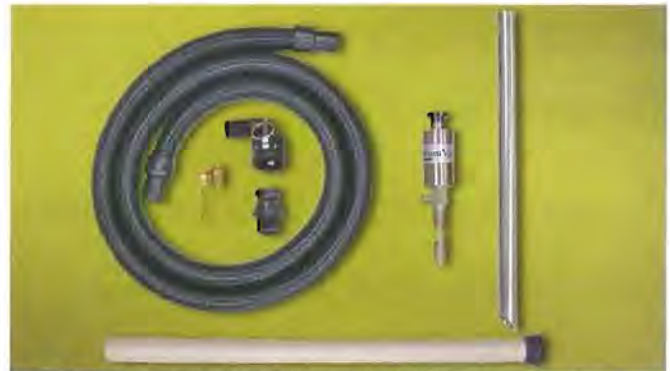
The Model 6196 and Model 6196-30 Reversible Drum Vac Systems include a vacuum hose and an aluminum wand.