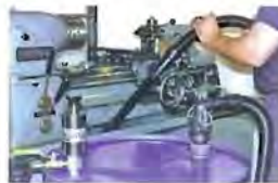
Model 6296 Reversible Drum Vac fills or empties machine sumps quickly and easily.

A steel drum with nominal thickness of 1.5mm (16 gauge) is recommended (ANSI Standard #MH2-1997).