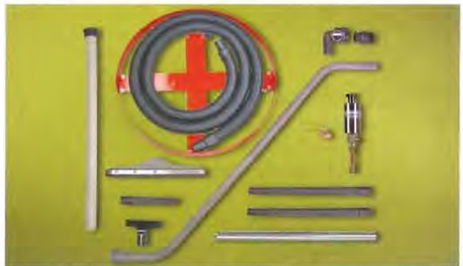
Model 6296 Deluxe Reversible Drum Vac System includes a 55 gallon drum dolly, spill recovery kit, vacuum hose and all tools.

A steel drum with nominal thickness of 1.5mm (16 gauge) is recommended (ANSI Standard #MH2-1997).