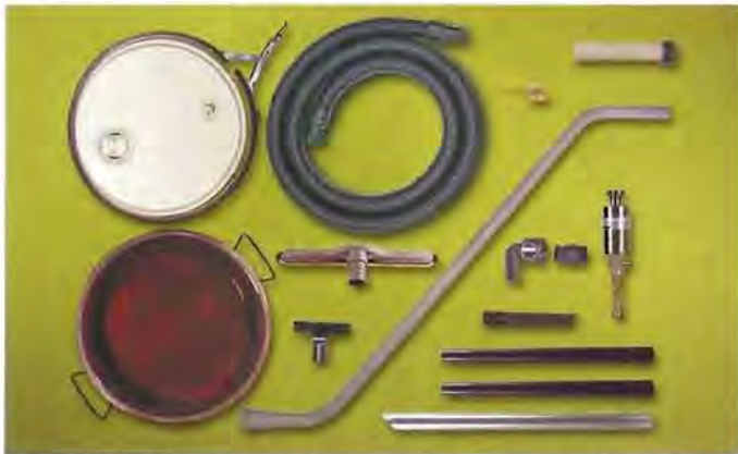
Model 6196-5 Mini Reversible Drum Vac System includes a 5 gallon drum w/lid, spill recovery kit, vacuum hose and all tools.

Warning: Do not use with any material with a low flash point or with flammable liquids such as fuel oil, alcohol, mineral spirits, gasoline, or kerosene.