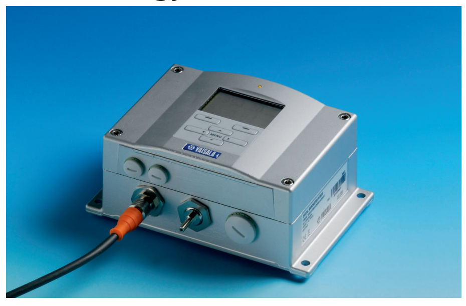
Vaisala BAROCAP® Digital Barometer PTB330 with a new trend display.